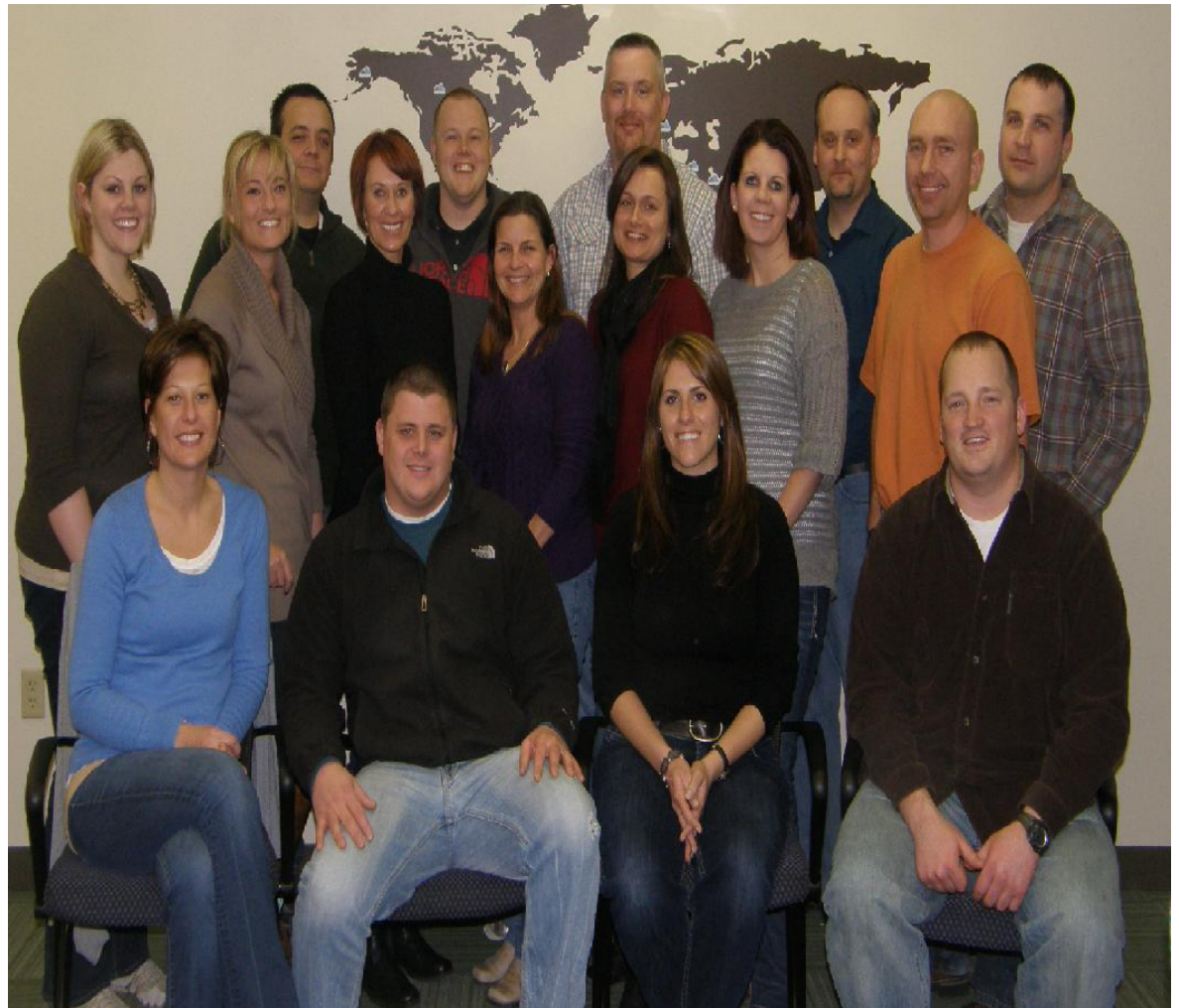
Participants in a 2013 CornerHouse Basic Forensic Interview Training

Click here to learn more and register now.