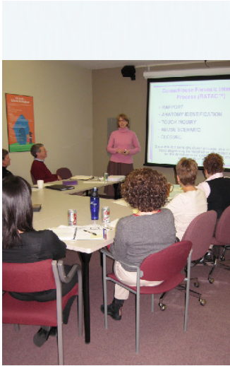
"The most complete training I have ever attended" — CornerHouse Training Participant