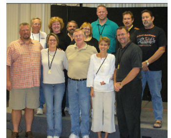
2006 Annual Golf Tournament Fundraiser check presentation