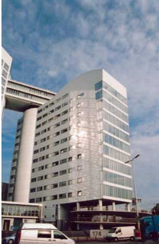
Above: Outside the International Criminal Court, (ICC).